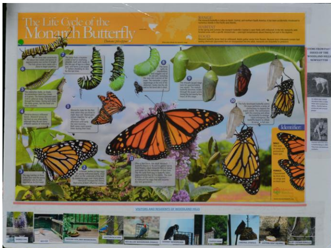
Above – Monarch Butterfly Display – Habitat Group Event, May 2015

The community also hosted Home Tree Care 101, educating residents on do-it-yourself planting, mulching and pruning techniques.