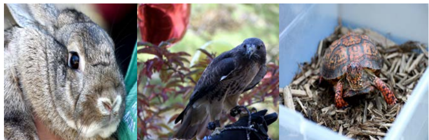
Echoes of Nature Wildlife Ambassadors; rabbit, red hawk and box turtle.

Fall gutter cleaning will be offered by North Landscaping for $30 and is scheduled for Nov. 30 and Dec. 1, weather permitting. Leave checks (with addresses noted) at 314 Wye Mill Court. Watch Listserv for the notice.